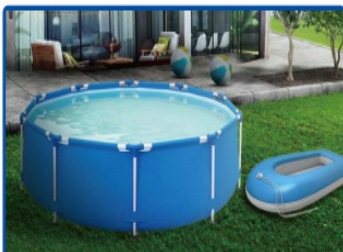
Portable Swimming Pool