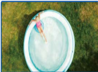
Inflatable Swimming Pool